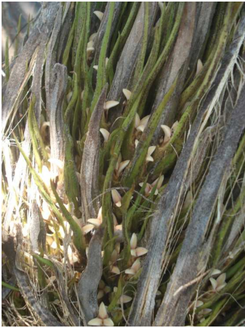
Inflo.11T at DAP = 2