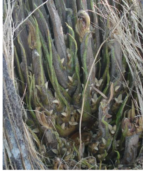
Inflo.8T at DAP = 1