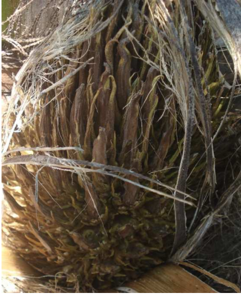
Inflo.4T at DAP = 0