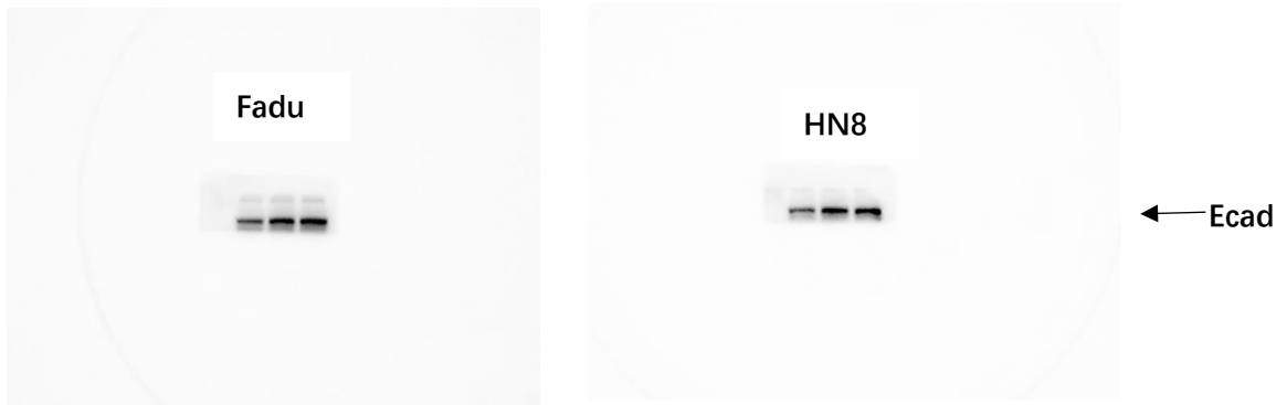
WB original data for Figure 9A